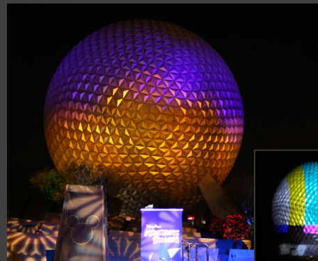
Managing spherical distortion & color to support Pixar's precise animation specs.